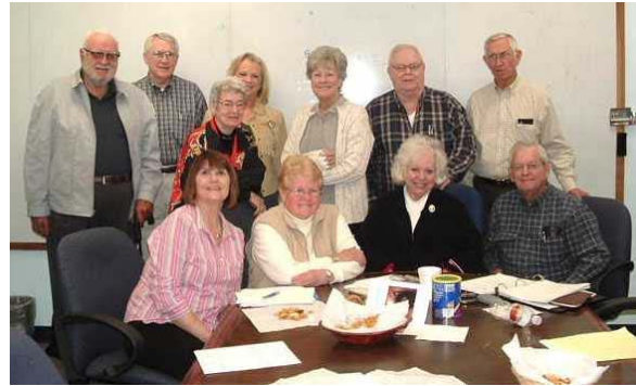
Quad District Tissue and Eye Bank Meeting March 8, 2008 at UT Southwestern Transplant Services Center in Dallas, Representatives from Districts 2E-2, 2E-1 , 2X-2, and 2X-1 attended.