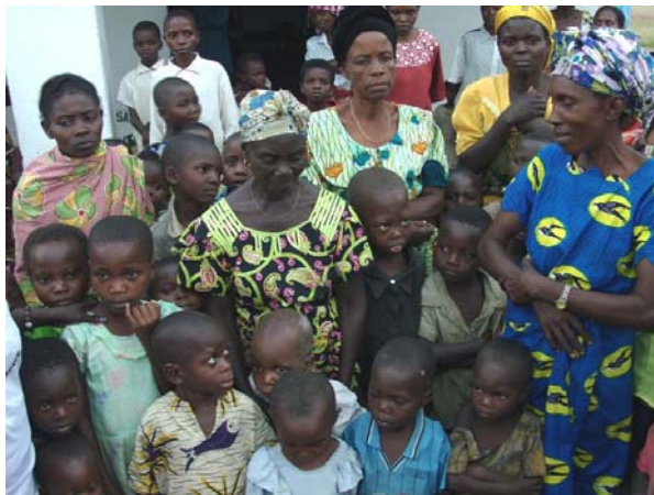
“Please don’t forget us”, they said.

The few people in Kamina who are fortunate enough to have jobs earn about $15 - $20 per month, and even if they could make the trip to Lumbumbashi, the cost for a pair of new eyeglasses is far more than their annual income. Therefore, the people in Kamina numbering over 200,000 have simply gone without skilled optical care and corrective vision.