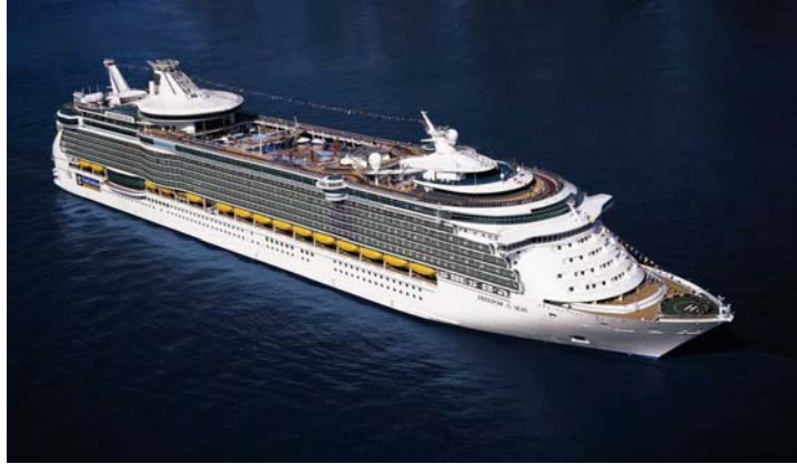
Royal Caribbean Cruise Line's