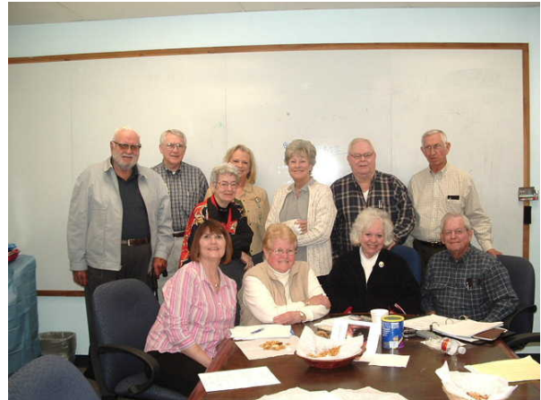
Quad District Tissue and Eye Bank Meeting March 8, 2008 at UT Southwestern Transplant Services Center in Dallas, Districts 2E-2, 2E-1, 2X-2, 2X-1